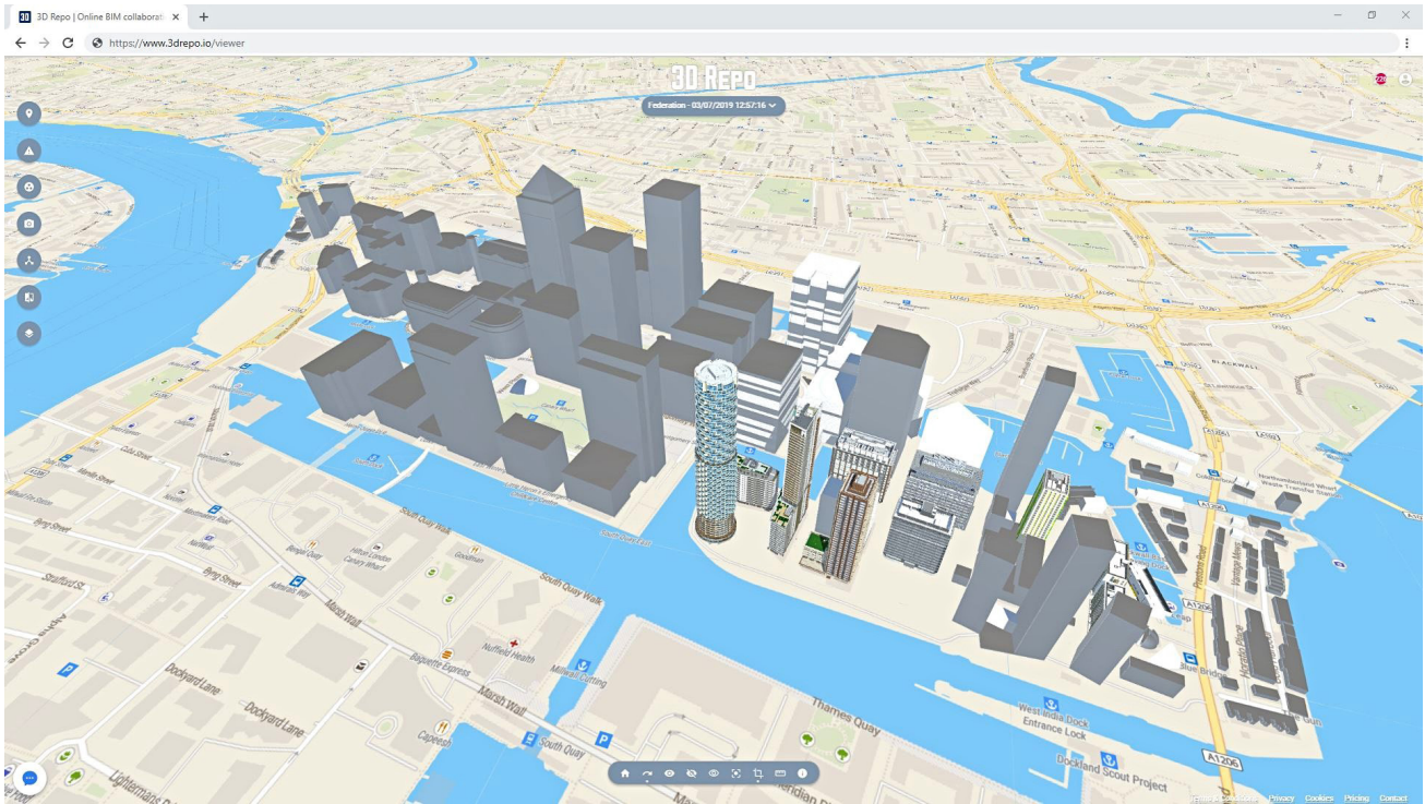
Figure 1: Federation of the Wood Wharf models from the 3D Repo platform. Watch the video about Wood Wharf by The B1M at https://youtu.be/SNXotuREZQ4