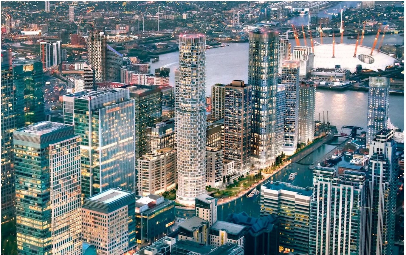
Figure 2: An illustration of what Wood Wharf might look like on completion of the construction project.

Project Executive, Canary Wharf Contractors