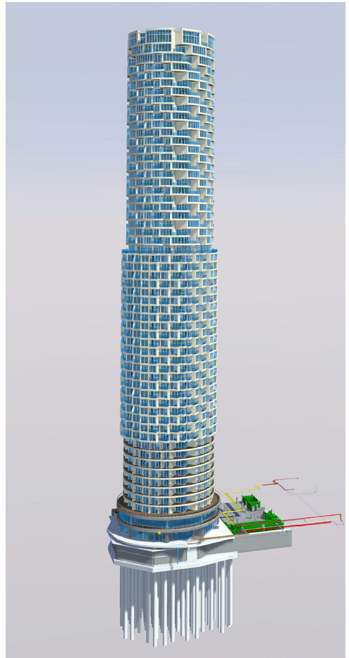
The A1 Tower, federated model in the 3D Repo platform.

3D Repo's health & safety tool, SafetiBase allows users to identify issues and potential hazards with the model before any people set foot on site. These issues are then assigned to the appropriate person or team to find a solution to the problem and mitigate any risk to make for a safer build. SafetiBase conforms to the specification for 'collaborative sharing and use of structured health and safety information using BIM' (Publicly Available Specification PAS 1192-6).